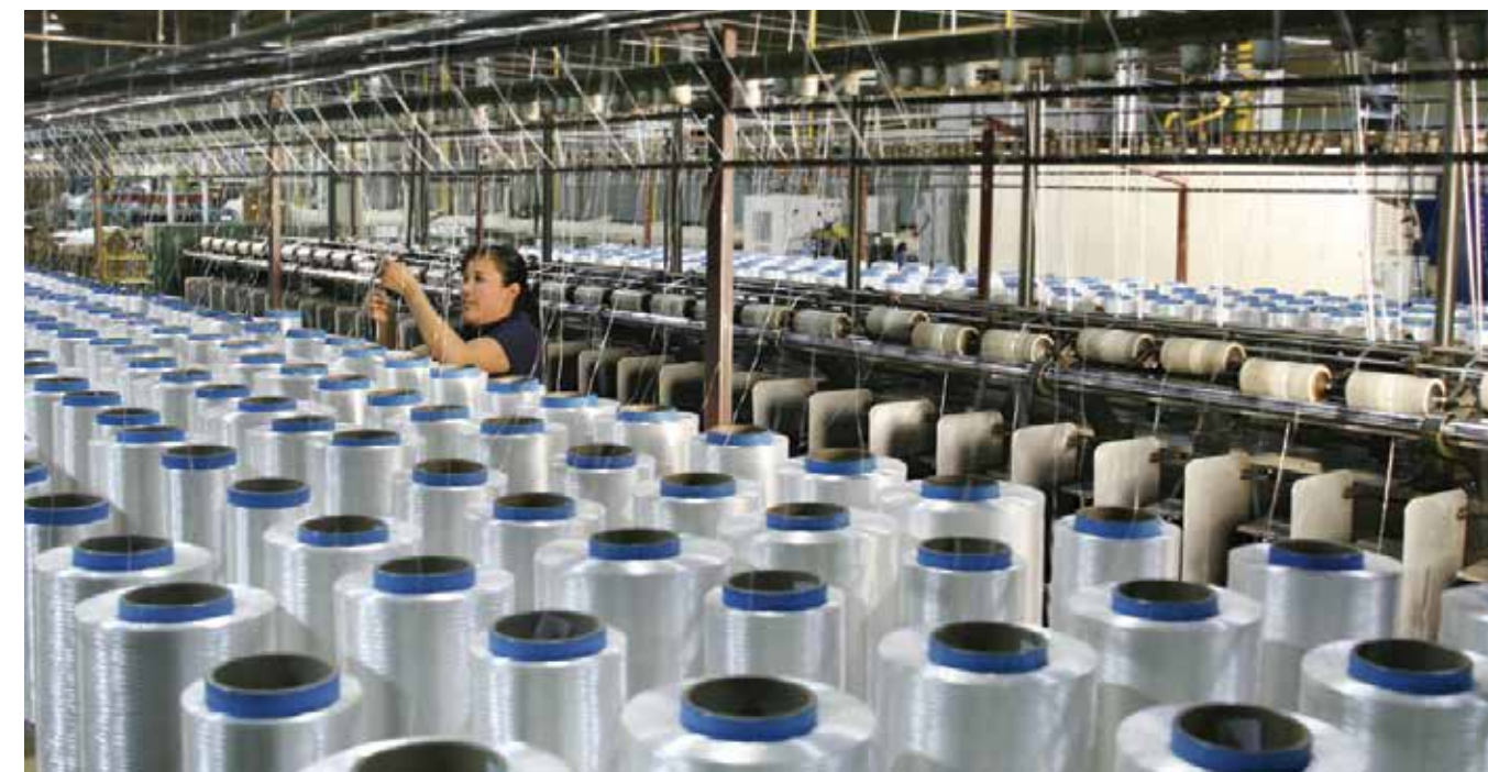
The ring twister combines multiple piles of high tenacity filament polyester yarns.