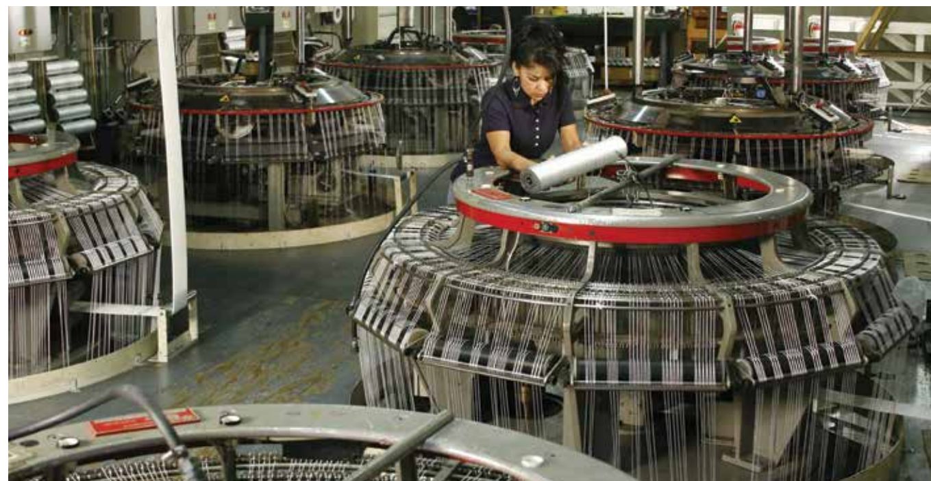
Our state-of-the-art weaving facility.