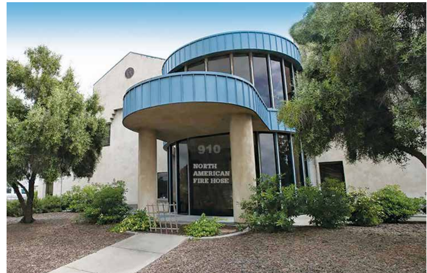
North American Fire Hose Corporate Headquarters